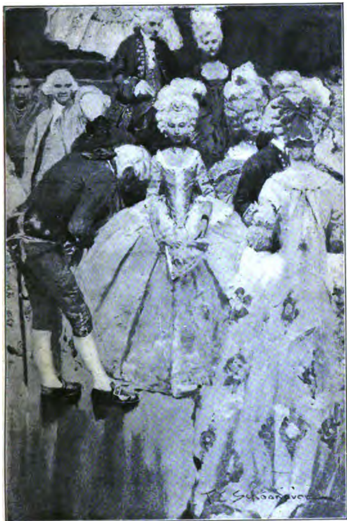
“SILVER HEELS! I STAMMERED”